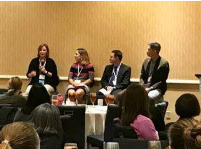
A Big Thank you to our robust and diverse career panel participants!!