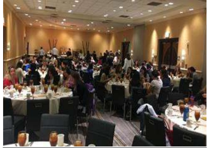
The senior faculty career panel occurred during the Trainee Luncheon on Sunday, allowing larger number of trainees to hear from experienced SDBP members.