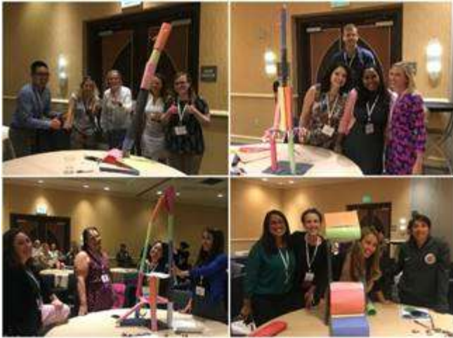
On Saturday night, we held the first ever Trainee "Meet and Greet", which gave trainees more time to network with each other.